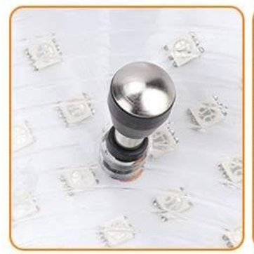
Microcurrent Contact Can strengthen the absorption of skin nutrition