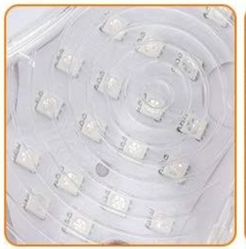
192* LED Lamp Beads Produce more rapid and deep beauty effect