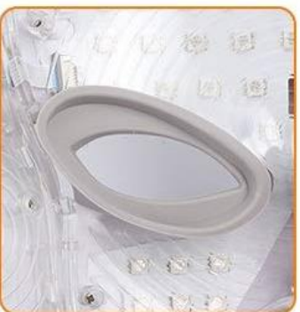
Silicone Pads Intimate eye protection