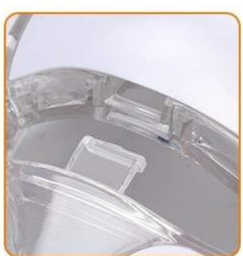
Neck Connector Can be used separately or together